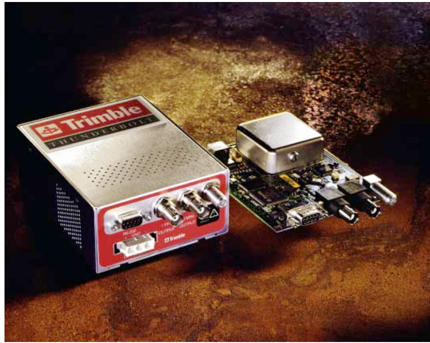
Trimble's Thunderbolt GPS Disciplined Clock in enclosure, and board form.

Trimble's approach is unique. The Thunderbolt GPS Clock outputs a 10 MHz reference signal and a 1 PPS signal with an over-determined solution synchronized to GPS or UTC time. The 10 MHz reference accommodates applications requiring sub-microsecond timing. A single microprocessor per-